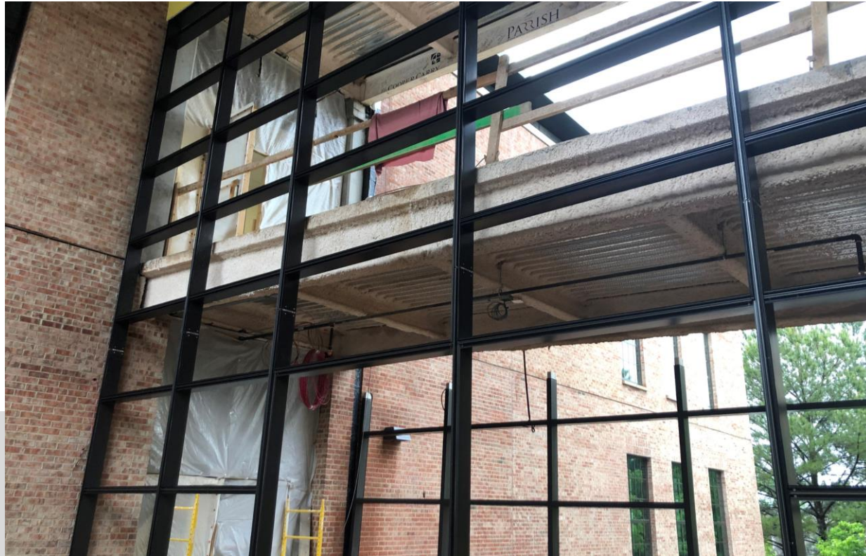
Curtainwall Frames Installed at New Addition Bridge