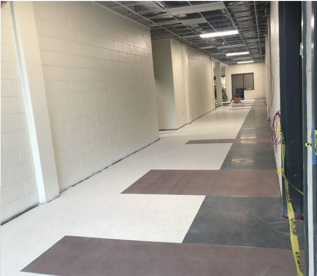
Terrazzo Installed on Second Floor of New Addition Building