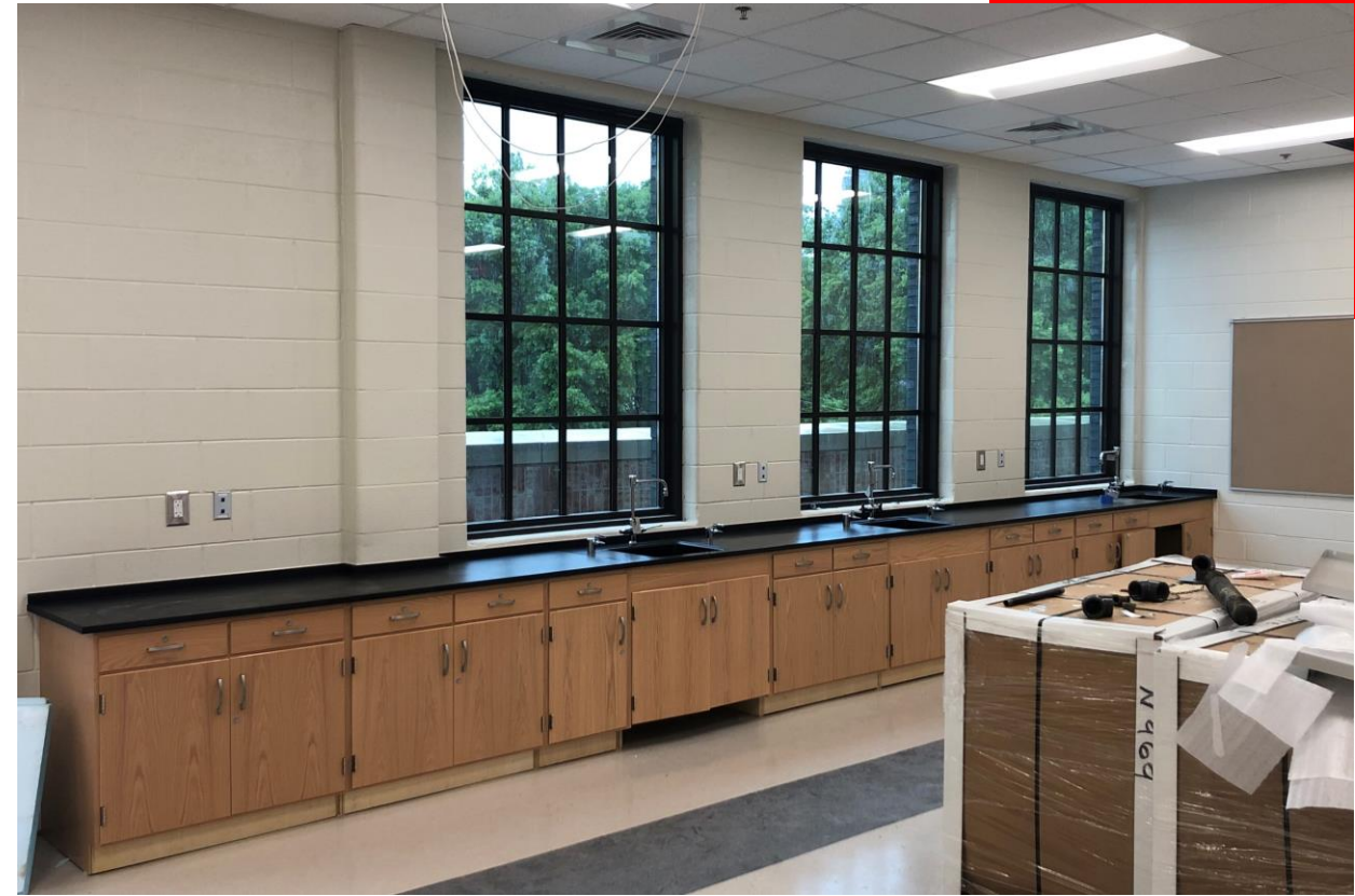
Casework Installed in Science Labs in New Addition Building