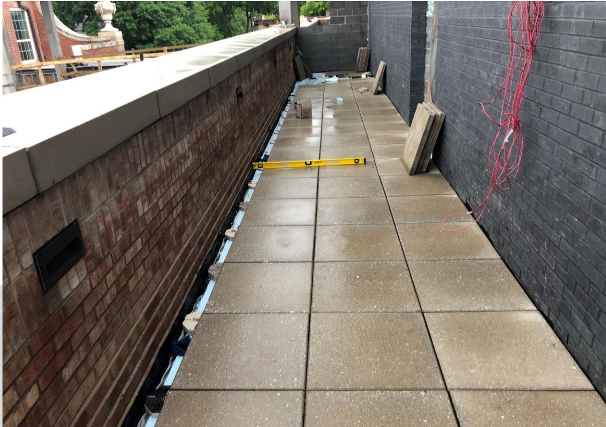
Patio Paver Progress at New Addition Building