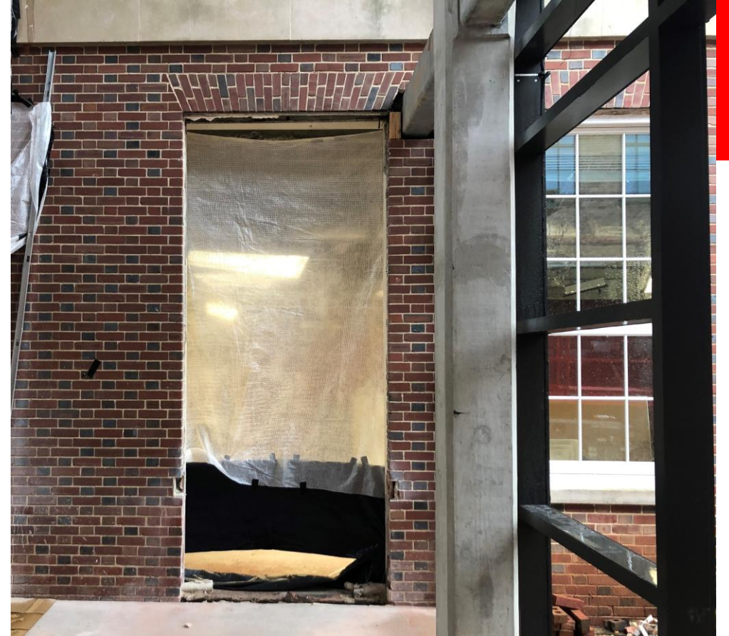
Demolition Complete for New Door Opening for New Reception Area in Charles Allen Building